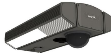
Model : PRO-2020B